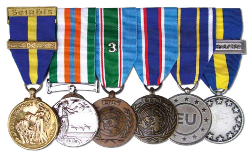
MOUNTING OF 6 MEDALS