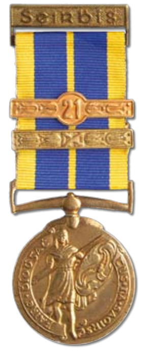
OBVERSE 21 YEARS' SERVICE