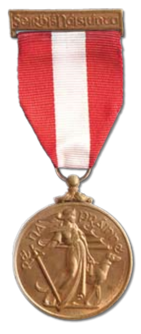
OBVERSE OTHER ISSUES