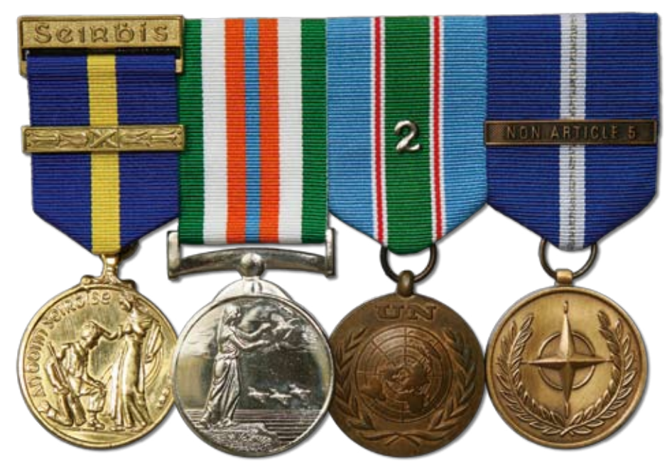
MOUNTING OF 4 MEDALS