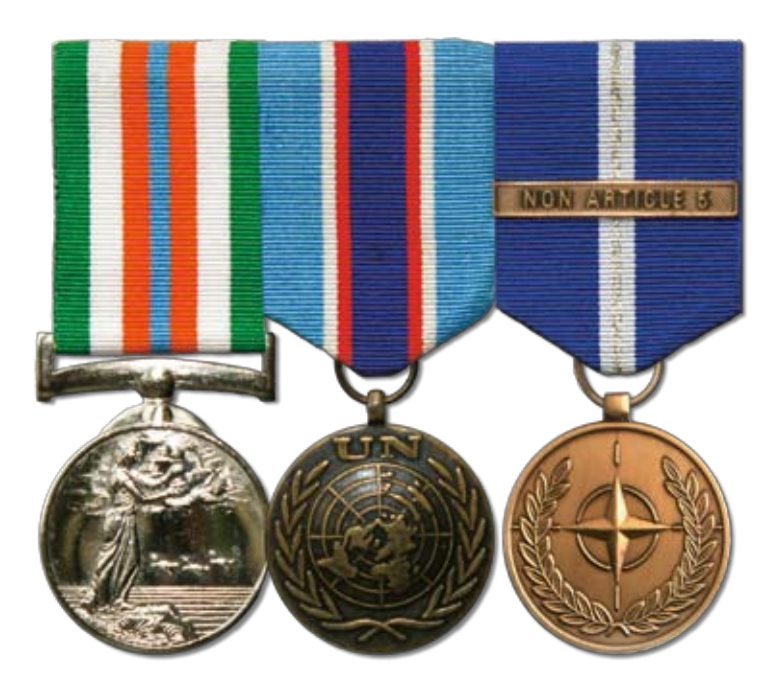
MOUNTING OF 3 MEDALS

Medals or Decorations should never be worn by personnel to whom they have not been awarded.