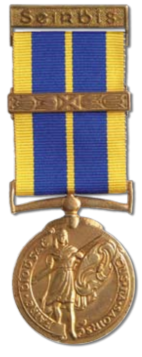
OBVERSE 12 YEARS' SERVICE